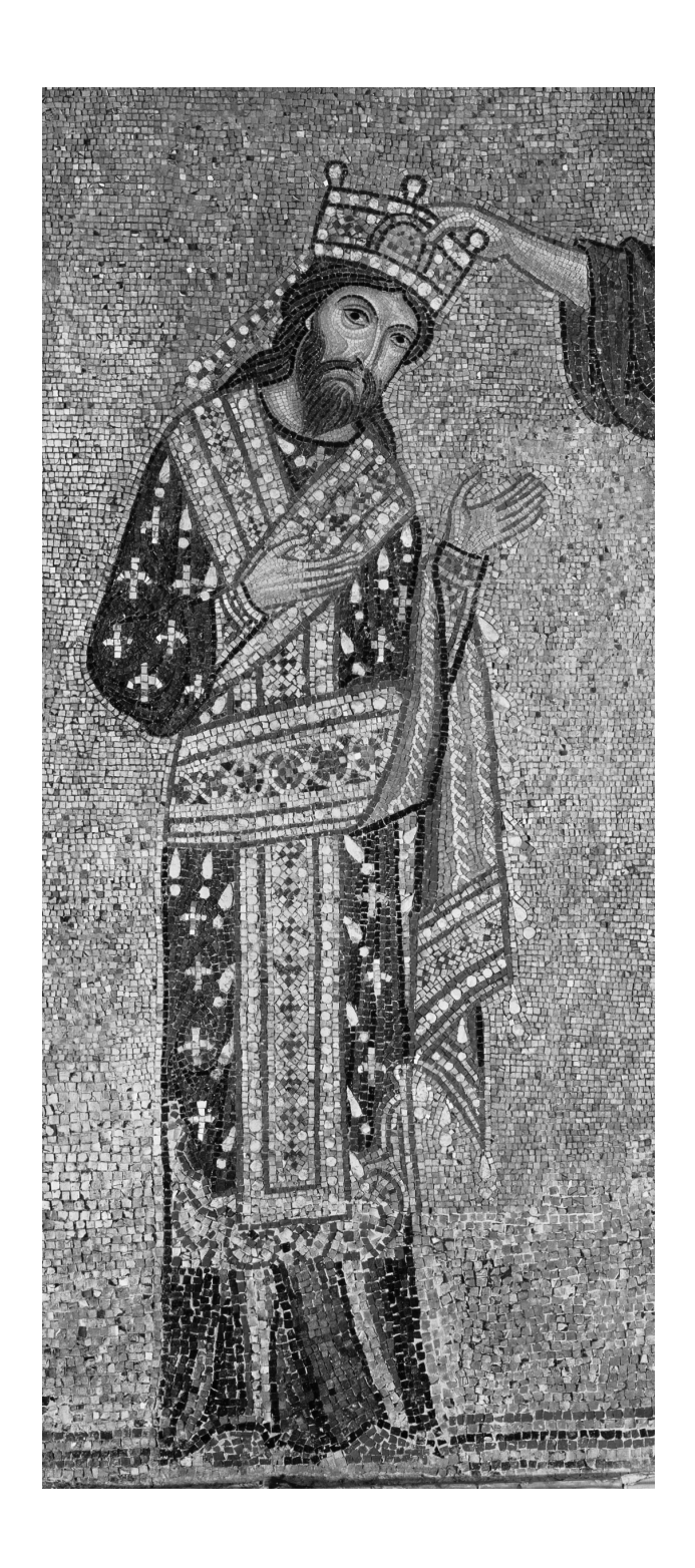
Coronation of King Roger II, Palermo, Church of the Martorana